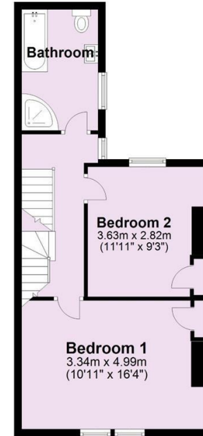
First Floor Approx. 43.8 sq. metres (471.5 sq. feet)